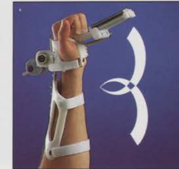
Full composite flexion