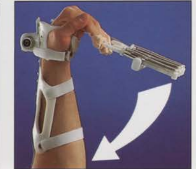
Intrinsic Plus position