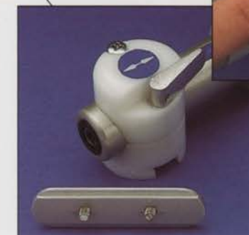
Attach the H3 to a custom splint or a cast using the H3 Custom Mounting Kit.