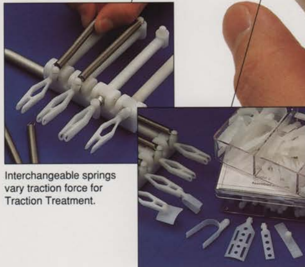
Interchangeable springs vary traction force for Traction Treatment.