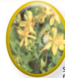
St. John's Wort flowers

Two time-honoured herbs in this traditional calmativie combination. St. John's Wort has been used in herbal medicine for over 2000 years.